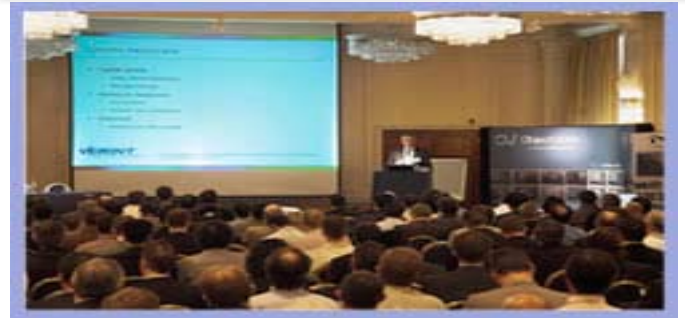
VCA Conference Europe